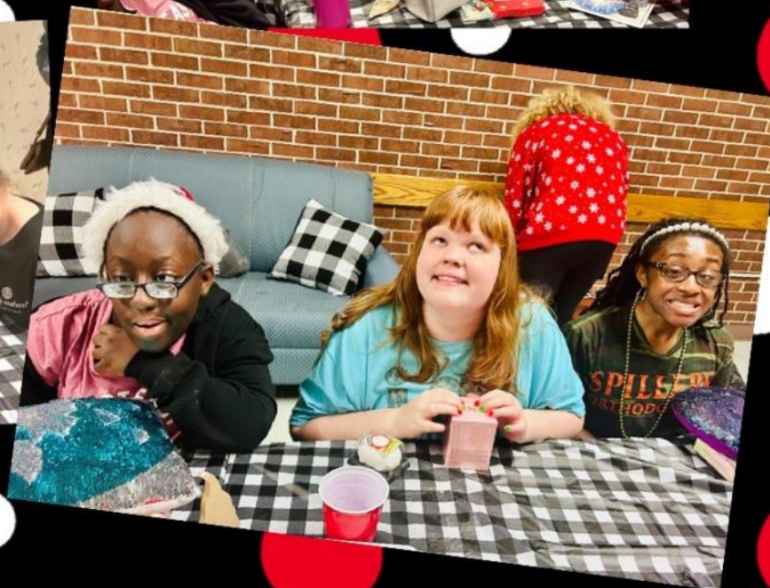
Holiday gathering for girls in Cottage 5 (C5).