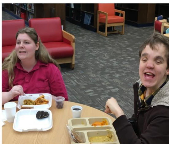
Left: Students enjoying Lunch in the Library for good behavior