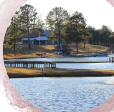
Camp Dream Lake