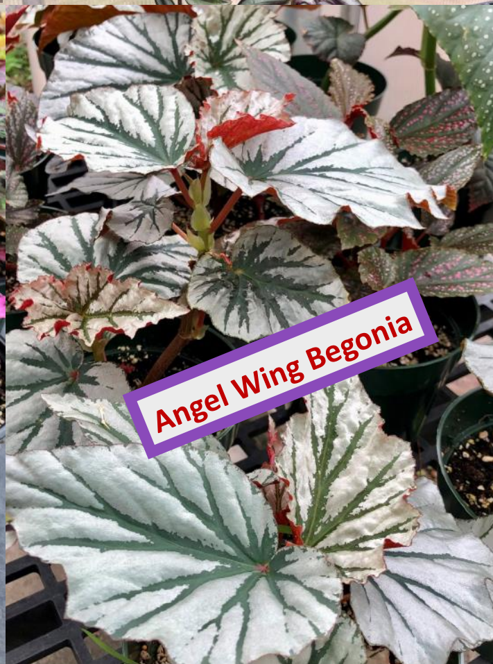
Angel Wing Begonia