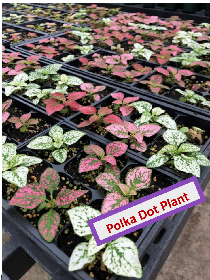
Polka Dot Plant