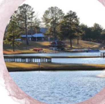
Camp Dream Lake