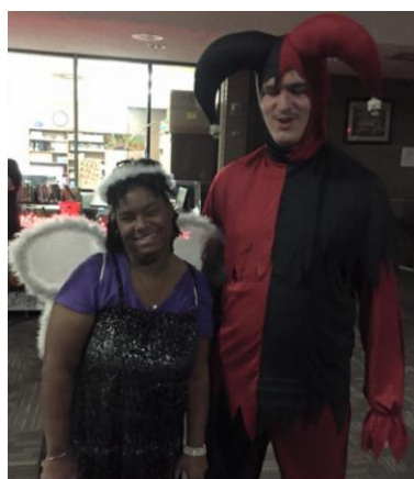
Right and left: EECC's Costume Party