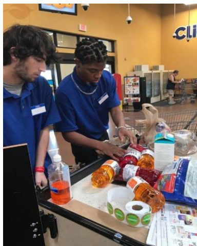
Right : WBL students at Kroger