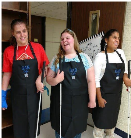
Left: GAB Café's Work Based Learning (WBL) students