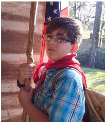
(Below) Boy Scouts enjoyed an afternoon of activities including hot dogs over a campfire.