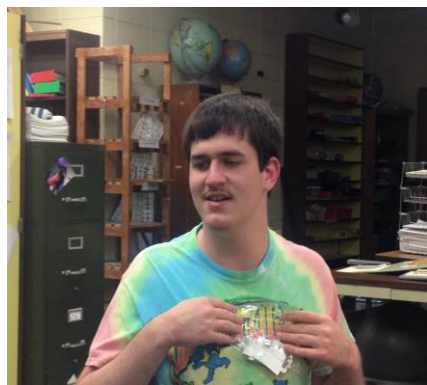
Proudly contributing Box Tops. Keep them coming!