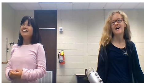
"It's a wrap!" This week's newscasters bidding their viewers a farewell!!