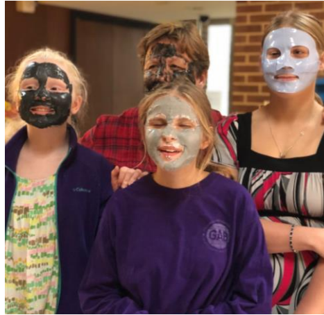
(Left) Students in the Real Life Money afterschool class compare the costs and quality of various skin care products.