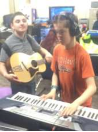
Music with a friend!