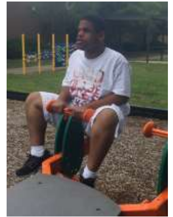
We've had our ups and downs!