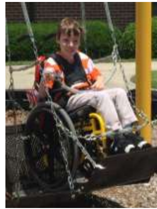
Swinging into summer!