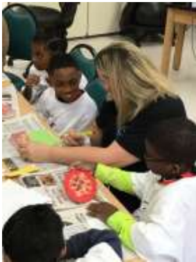
Braille Challenge 2017