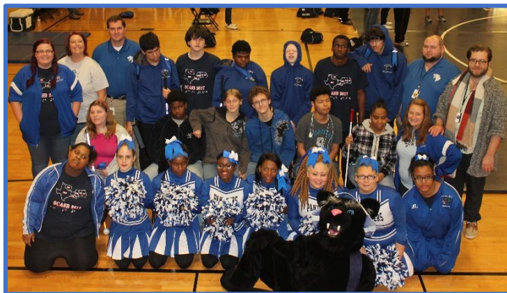
The entire SCASB Team including Senior Chorus, Louie the mascot and teachers.