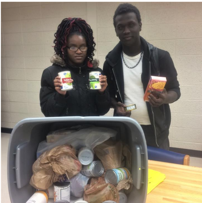
Left: Student Council members with the canned and boxed food items thus far.

Students, parents, staff and friends; please help us with these projects. The collection boxes will be located in the Multi-Purpose Room. These projects will continue until the last day of the semester, December 21st.